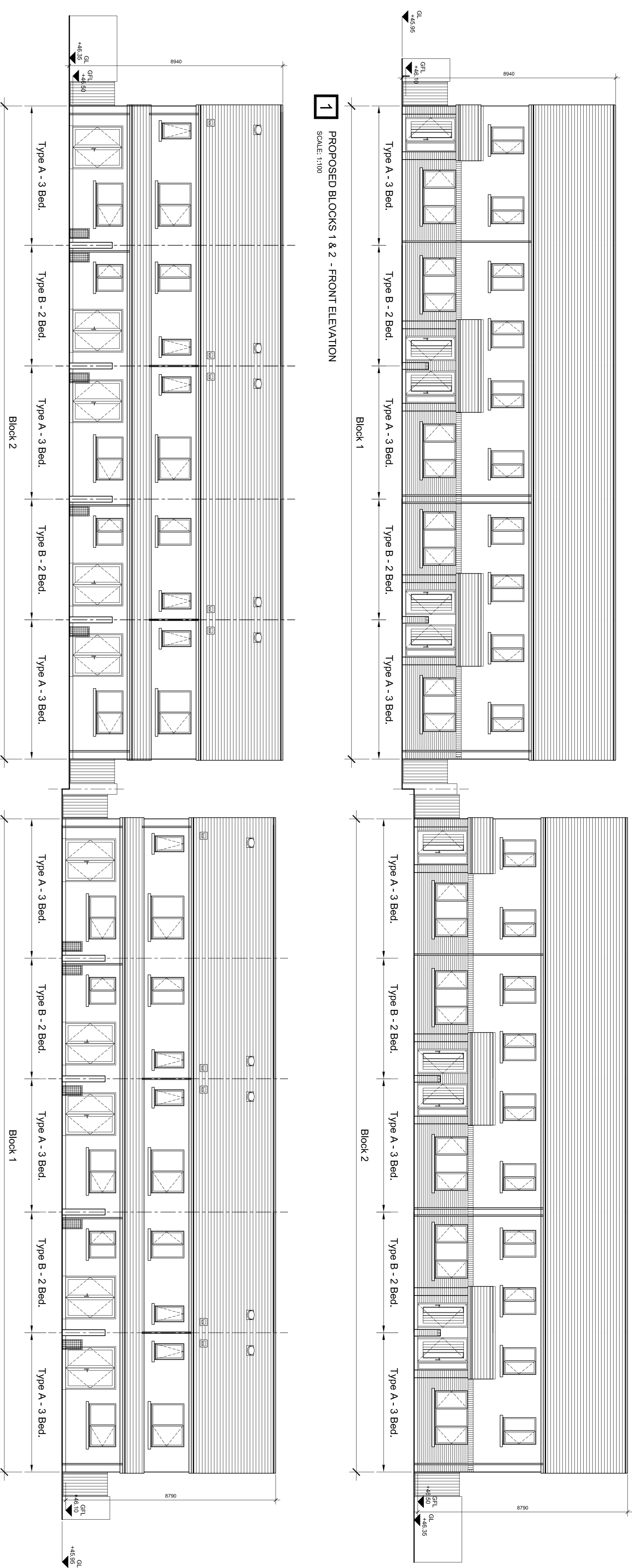
1 PROPOSED BLOCKS 1 & 2 - FRONT ELEVATION SCALE: 1:100