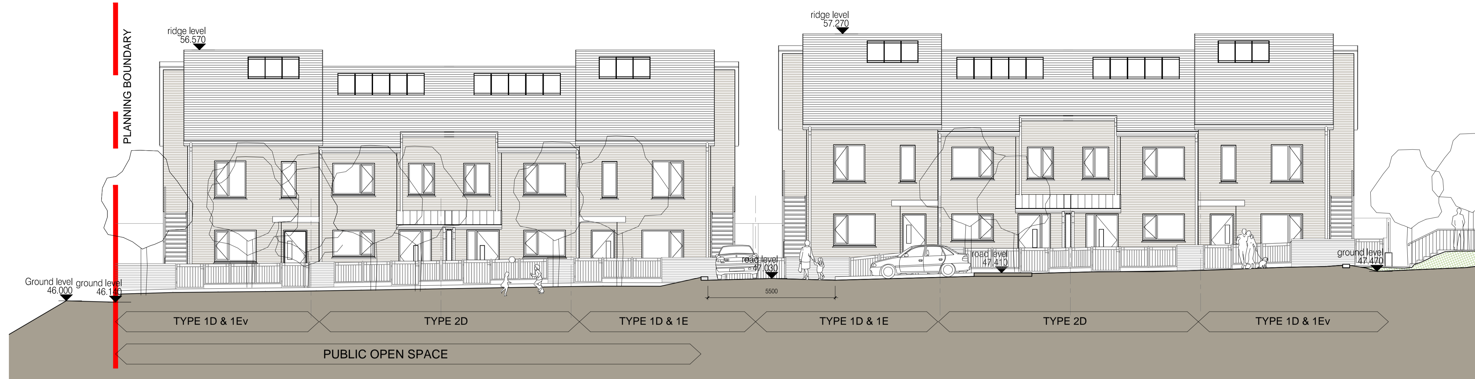
1 Contextual Elevation 2 Scale: 1:100