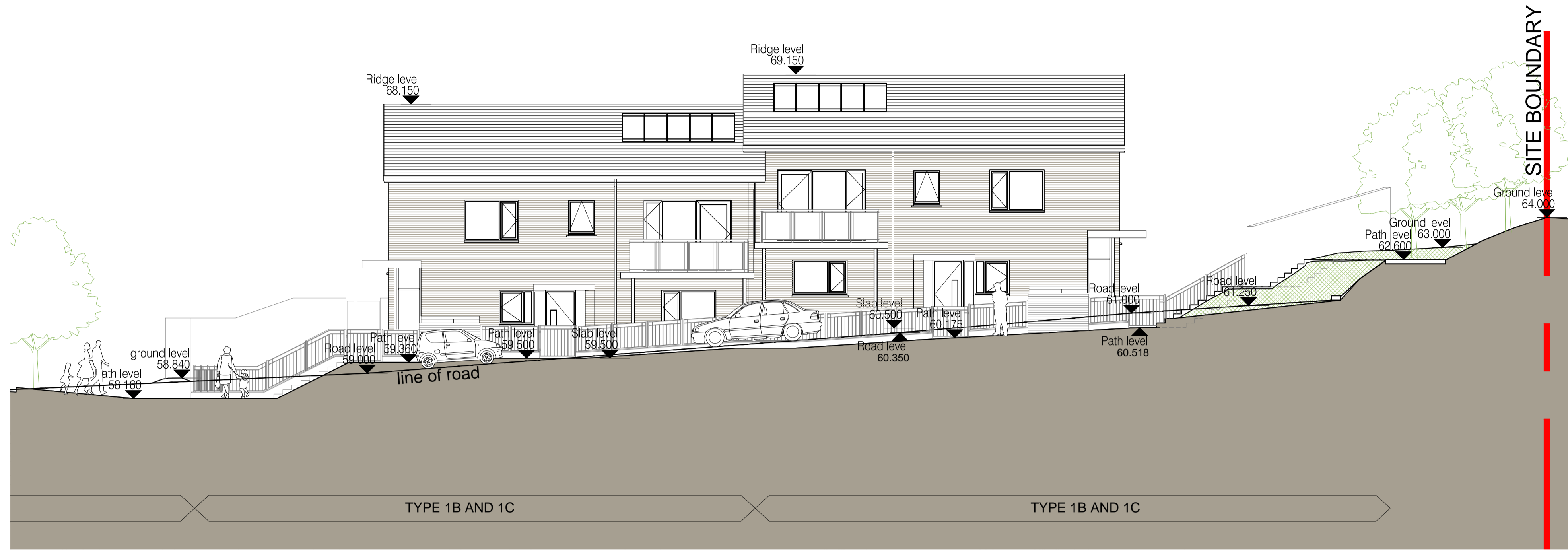
1 Contextual Elevation 4 Scale: 1:100