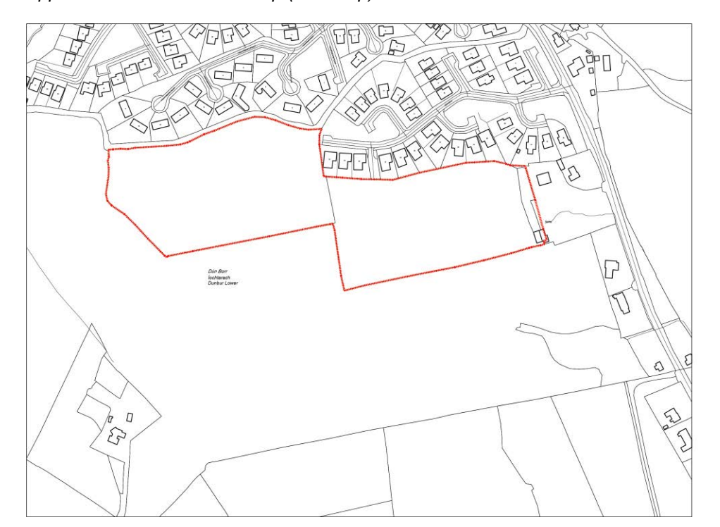
Appendix A: Site Location Map (OSI Map)